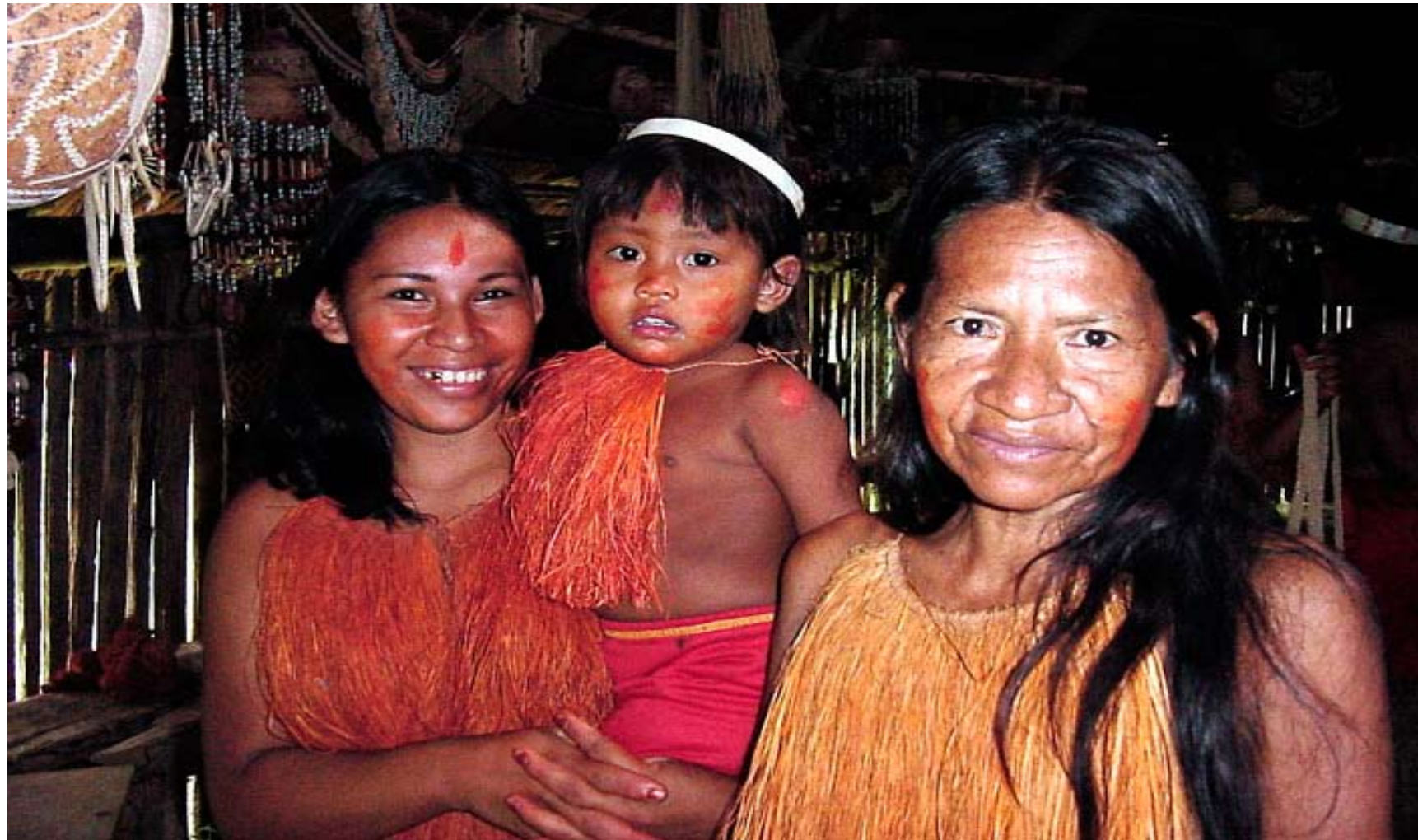
Yagua Indian Women Three generations