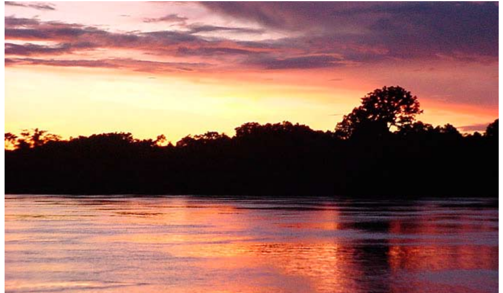
Sunset on the Amazon